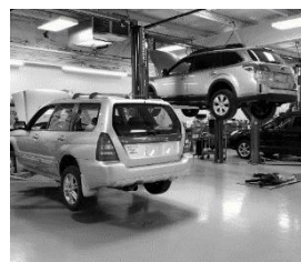
Car Service Centers