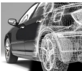
Car OEM R&D Labs