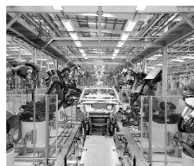
EV Manufacturing Lines