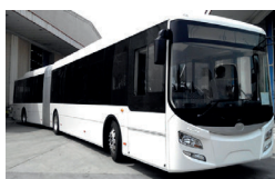
For all types of electric buses